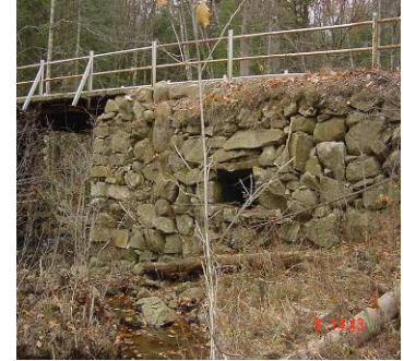
Stone Box Culvert

If historic resources might be adversely affected, different measures can be taken to avoid, minimize, or mitigate such adverse effects. FEMA, the NH SHPO, and the Applicant will consult to decide what measures, if any, are to be taken.